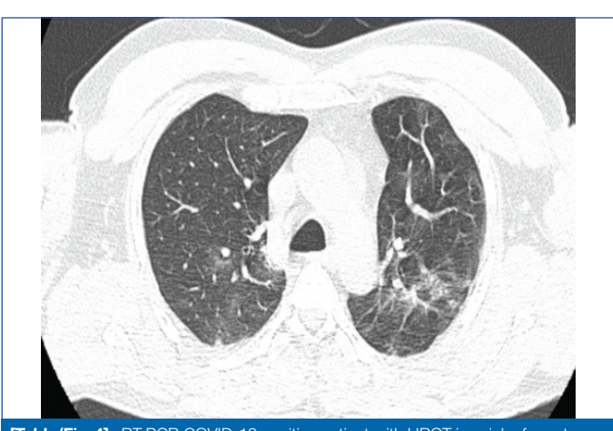
[Table/Fig-4]: RT-PCR COVID-19 positive patient with HRCT in axial reformat shows focal ground glass opacity in the posterior segment of left upper lobe, CTSI-1/25. (Mild Infection)

Among 184 mild COVID-19 infection [Table/Fig-4] cases, 84 were young, 56 were middle aged and 44 were under old age category [Table/Fig-5].